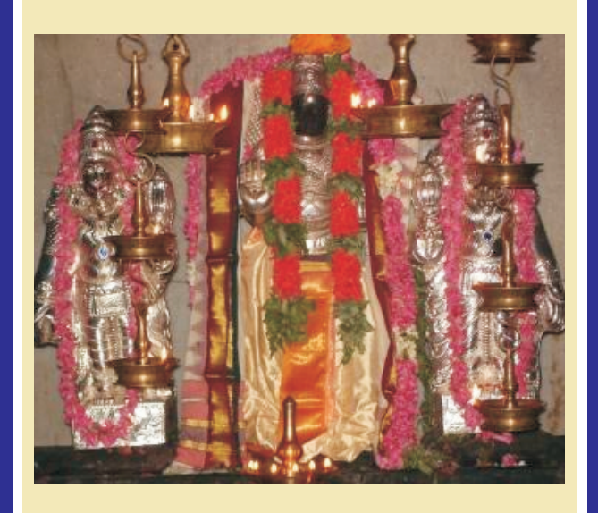
MAHANAVAMI NAVARATRI FESTIVAL SUNDAY 27th SEPTEMBER, 2009